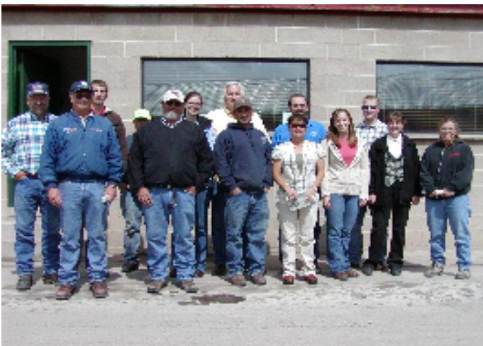
Gastrointestinadiabetesity Muffin Top Budonkadonk Board of Public Utilities (Left to Right)