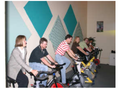
Wellness Committee members spinning at the YMCA

In addition to all of this we are teaming up with WINhealth, the Board of Public Utilities, and the Cheyenne Laramie County Health Department. Having these agencies working along side us will bring new ideas and plenty of experience.